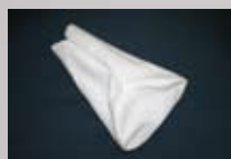
FMO-SOCK $18.54 (fits all older & newer)