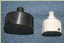
HO-FMO-CF $30.30 FMO-CF $25.48