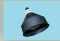
HO-BOOT100 $45.76 Fits Year 2000 and newer