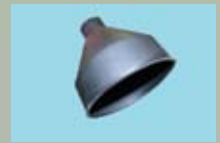
FMO-BTF $30.40 (fits all)