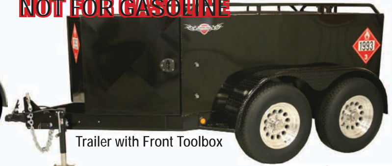
Trailer with Front Toolbox