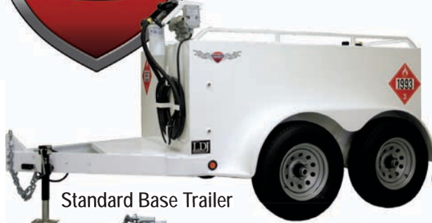
Standard Base Trailer